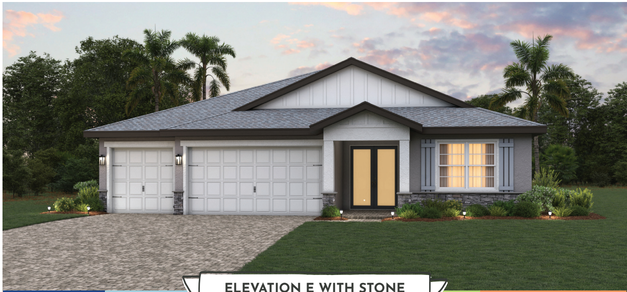
ELEVATION E WITH STONE