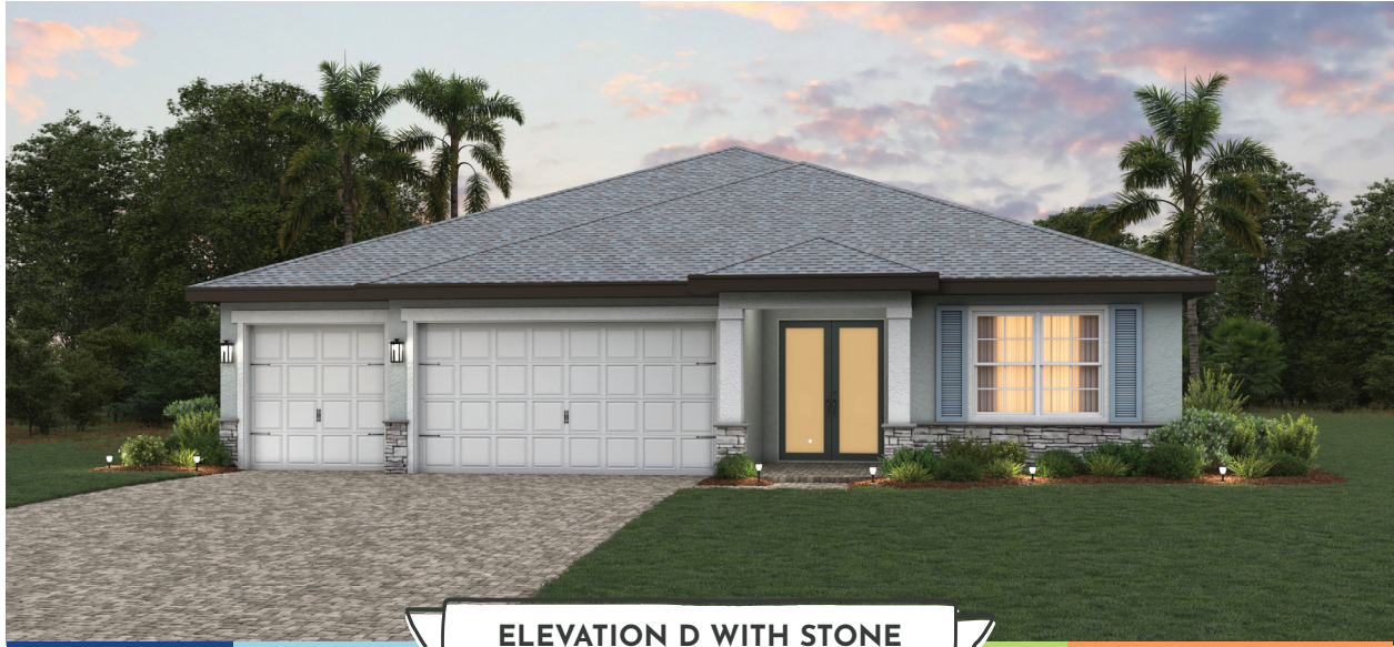
ELEVATION D WITH STONE

4 beds + den · 3 baths · 3-car garage · 2,635 sf a/c